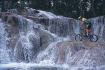
Dunn's River Waterfall, Jamaica 1993