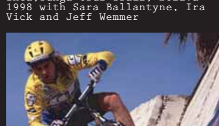
Riding down a 13 story skyscraper in Auckland, New Zealand 1998