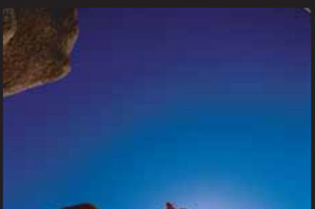
Joshua Tree, California 1998