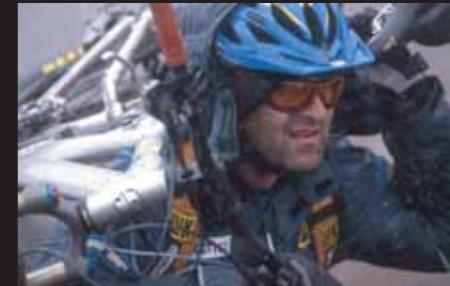
Snowstorm on Mt. Kenya, Africa 2004