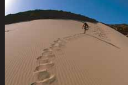
High above Capetown, South Africa 1997