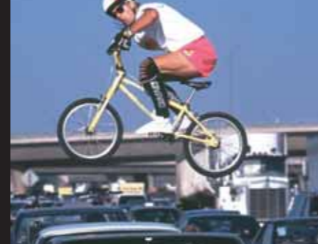
Rushhour 405 Freeway Los Angeles, 1989