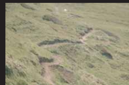
Stuntman and stunt-coordinator Willy Bogner movie, St. Moritz 1989