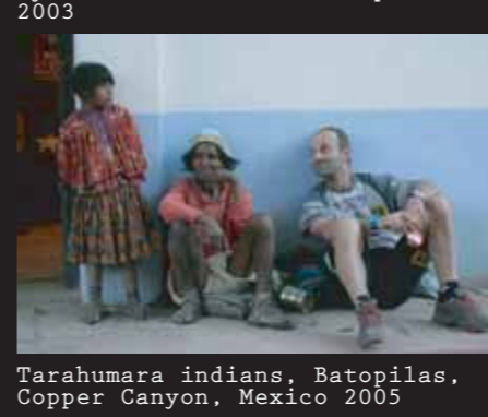
Tarahumara indians, Batopilas, Copper Canyon, Mexico 2005