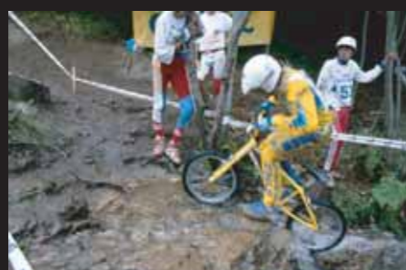
UCI Trials World Championship round, France 1987