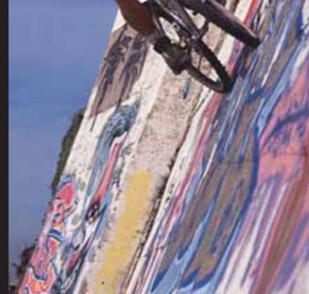
Old school wallride (ridget, lycra, straight) Huntington Beach, 1992