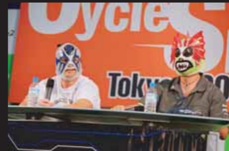
Press Conference at the Tokyo Cycle Show with Brian Lopes 2003