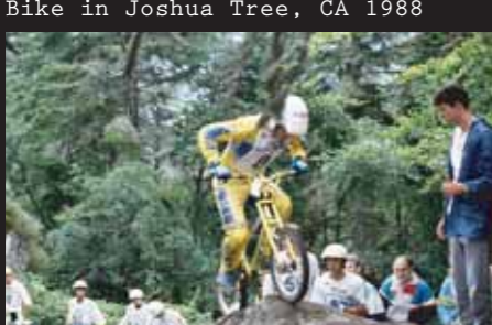
UCI Trials World Round in France 1987