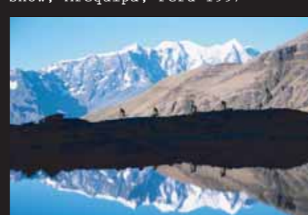
Rettenbacher Fern Glacier, Austria - No Way Transalp 1999