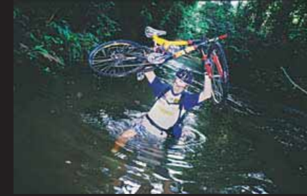
Headhunter Trail, Borneo, Malaysia 2000