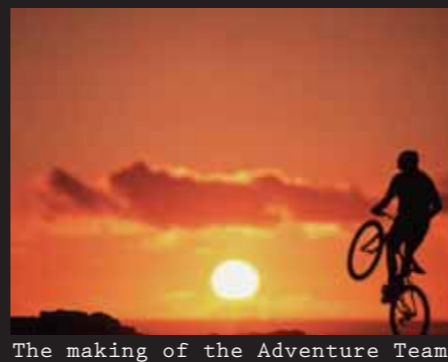
The making of the Adventure Team Logo, Hawaiian Sunset 1998