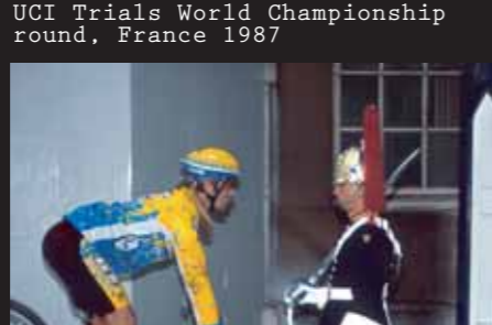
UCI Trials World Round in France 1987