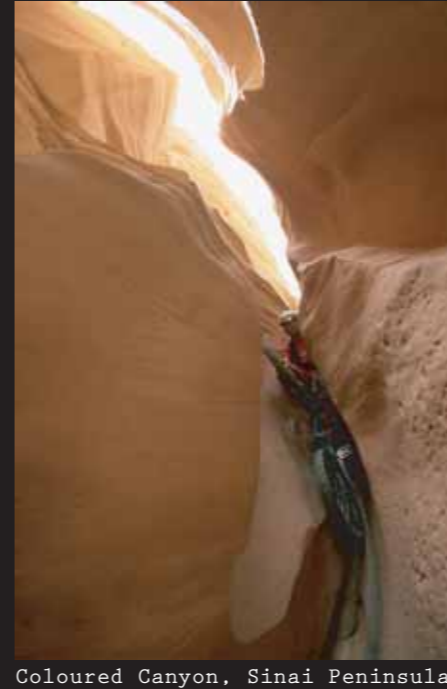
Coloured Canyon, Sinai Peninsula Egypt 2001