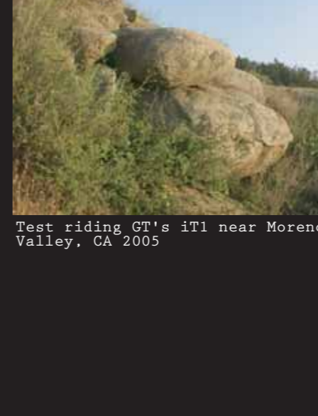
The Alta Rezia Freeride with Thomas Frischknecht, Livigno, Italy 2005