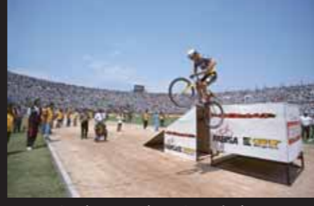
One of thousands of trials shows, soccer game halftime show, Arequipa, Peru 1997