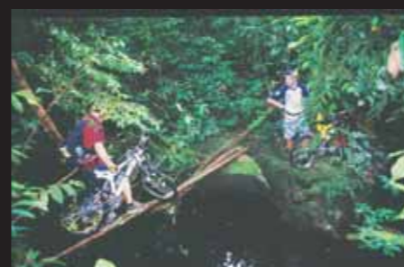
Headhunter Trail, Borneo with Steve Peat 2000