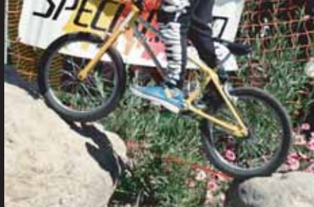
Dunn's River Waterfall, Jamaica 1993