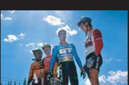
Rettenbacher Fern Glacier, Austria - No Way Transalp 1999