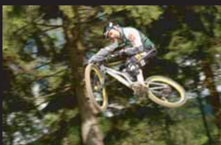
Geisskopf Bikepark Germany 2003