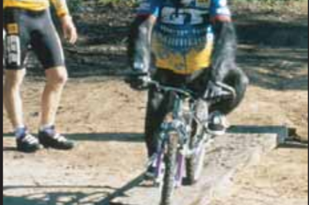
UCI Trials World Championship round, France 1987