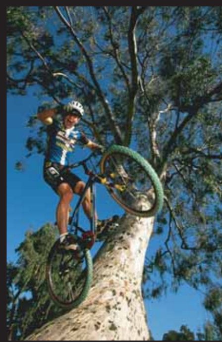
One-handed lycra treeride, Huntington Beach 1997