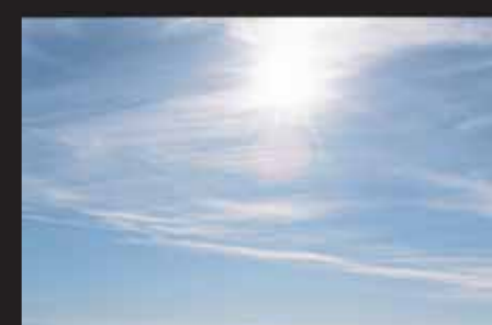
Rio de Janeiro, Brazil 2001