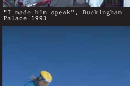
Snowbiking in Big Sky, Montana 1992