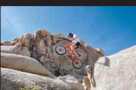
The original GT Ricochet Trials Bike in Joshua Tree, CA 1988