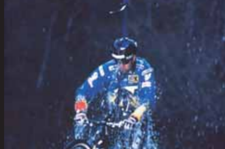
Underwater Bungee Jump Queenstown, New Zealand 1995