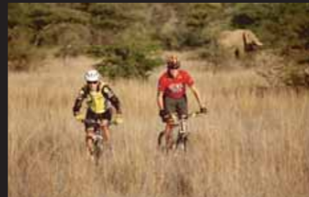
Bike safari with H-Ball in South Africa 1997

Congratulations, Hans. Happy 20th Anniversary.