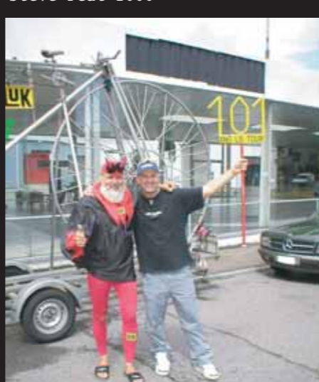
OLN correspondent at Tour de France 2004 chasing down the devil